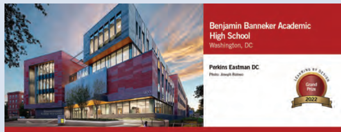
Benjamin Banneker Academic High School Washington, DC

Perkins Eastman DC